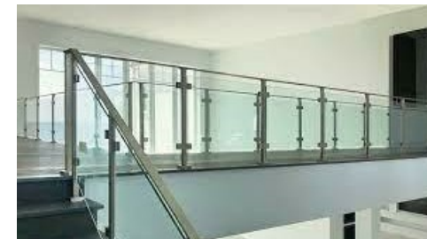
GLASS RAILING SIMILAR TO IMAGE